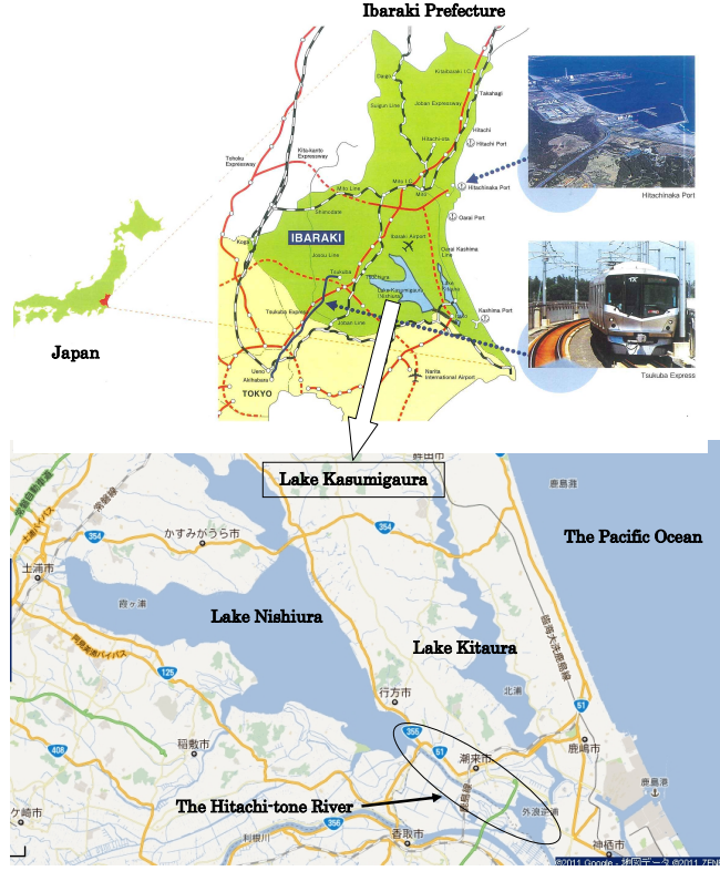
Fig.1 Location of Lake Kasumigaura

the 1987 plan for conservation of lake-water quality. However, the water quality of Kasumigaura has not improved since the 2000s, with a chemical oxygen demand (COD) of 7–9 mg · L<sup>-1</sup> (environmental standard 3 mg · L<sup>-1</sup>). To address this, Ibaraki Prefectural Government introduced the forest and lake environment conservation in 2008 and has promoted environmental conservation of the lake and responsible forestry management in the Kasumigaura basin. As of 2013, the environmental conservation tax for lakes and forests has been introduced in 33 prefectures, the first being Kochi Prefecture in 2003. About this time, I reported on the water quality of Kasumigaura in recent years and the measures against pollution of the lake taken using the forest and lake environment conservation tax.