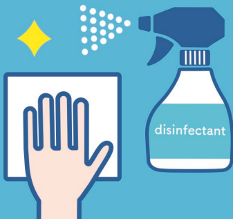
Enhanced disinfection of frequently in public areas