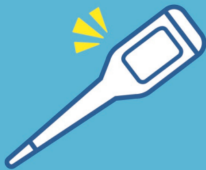
Temperature cheks of our staff