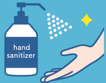
Provision of alcoh-bases hand sanitizers