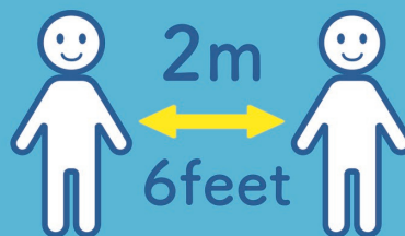
Keep a physical distancing