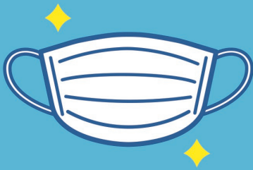
The use of masks