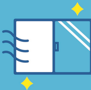
Has proper ventilation regularly