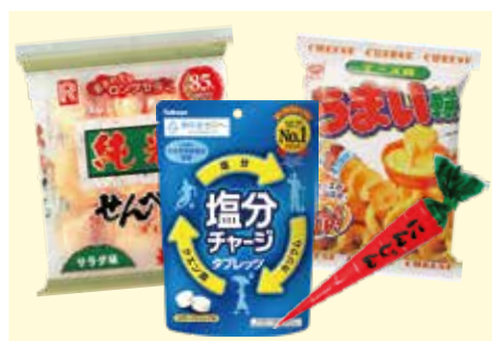
Sweets and Snacks