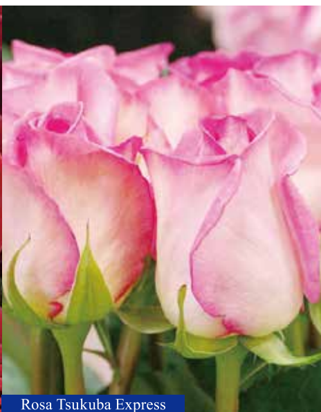
Rosa Tsukuba Express