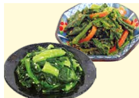
Ready-made Vegetable Dishes