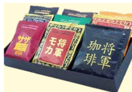
Drip Coffee Bags